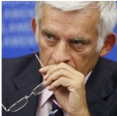
Jerzy Buzek MEP President of the European Energy Forum