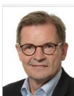
MEP Bendt Bendtsen

The EEF is pleased to welcome Mr Bendtsen as Active Member. Mr Bendtsen has been a member of the European Parliament for the Conservative People's Party since 2009. He sits in the Committee for Industry, Research and Energy (ITRE) and is member of the Delegation for relations with the People's Republic of China, as well as substitute of the International Trade Committee (INTA) and the Delegation for relations with the United States.