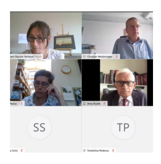
Summary of past Online Energy Debates