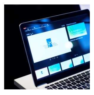
New Online Energy Debates on the EEF Programme