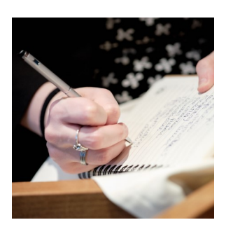
Briefing on Hydrogen: Session 2 coming up